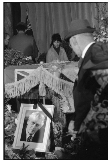
Alongside the coffin of the late Prime Minister Norman Kirk at Parliament House, Wellington.