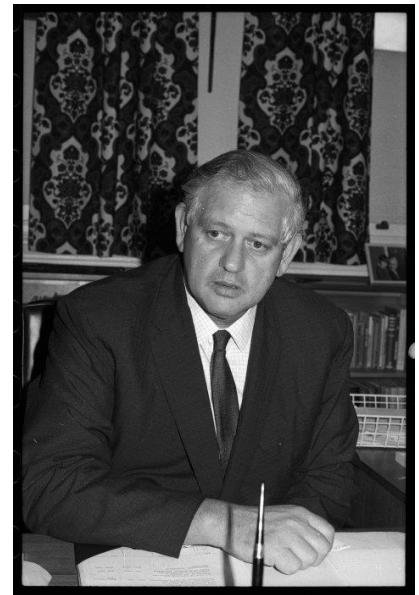
Prime Minister Norman Kirk.

Sefulu's poem is a remarkable tribute to a deceased former Labour Prime Minister Norman Kirk (1923-1974), and breaks through the boundaries of politics, race and culture with poignancy and ease.