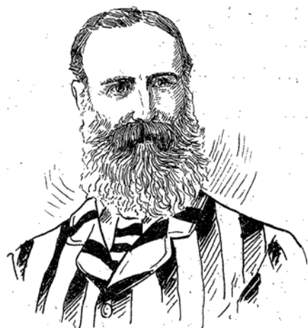
BILLY ROBINSON

AS = Auckland Star BPT = Bay of Plenty Times NM = Northampton Mercury NZH = New Zealand Herald TS = Thames Star